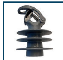
Insulator Pin Type with Ratchet