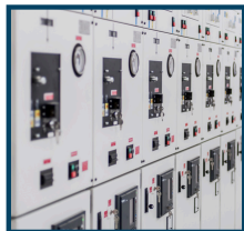
Switchgear & Breakers