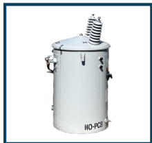
Pole Line Hardware & Accessories