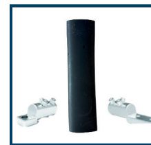
Termination Cold Shrink/Heat Shrink