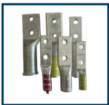
Medium & Large Compression Terminals

Along with PowerGuard® cable products, we also offer accessories such as splices, arresters, connectors, and more, making this a complete system.