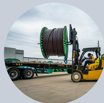
Same Day Shipping